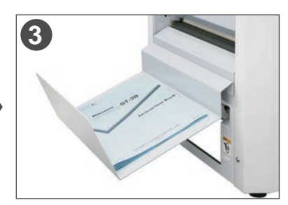
With auto mode, the SPF-7 starts as soon as prints are inserted and delivers to the tray.

Insert prints, align the side guide, then press the start button. The booklets are produced immediately.