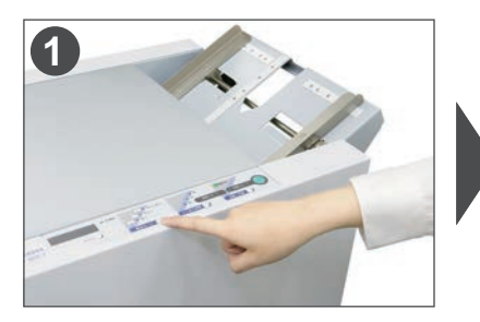
Select the job pattern and sheet size.