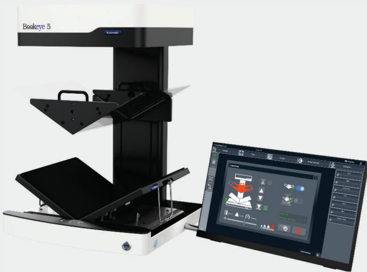
The Bookeye® 5 V3A Automatic with V-shaped book cradle and glass plate.

The V-shaped glass plate is controlled via the ScanWizard's extended user interface. The new control panel with animated function buttons allows, among other things, horizontal movement up and down, setting the speed or the position in which the glass plate remains after the finished scan job. It does not necessarily have to be at the top or bottom. Depending on requirements, the glass plate can be removed and refitted without tools and in two simple steps.